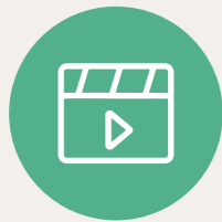
Movies and Films