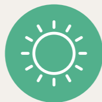
Outings and Excursions