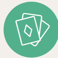
Games and Clubs