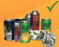
Steel, aerosol and aluminium cans