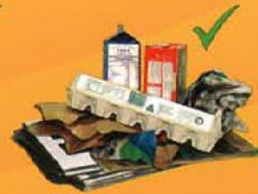
Paper, cartons and cardboard