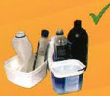
Plastic bottles and containers